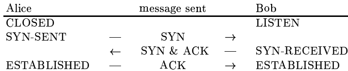
Fig. 1. TCP three-way-handshake